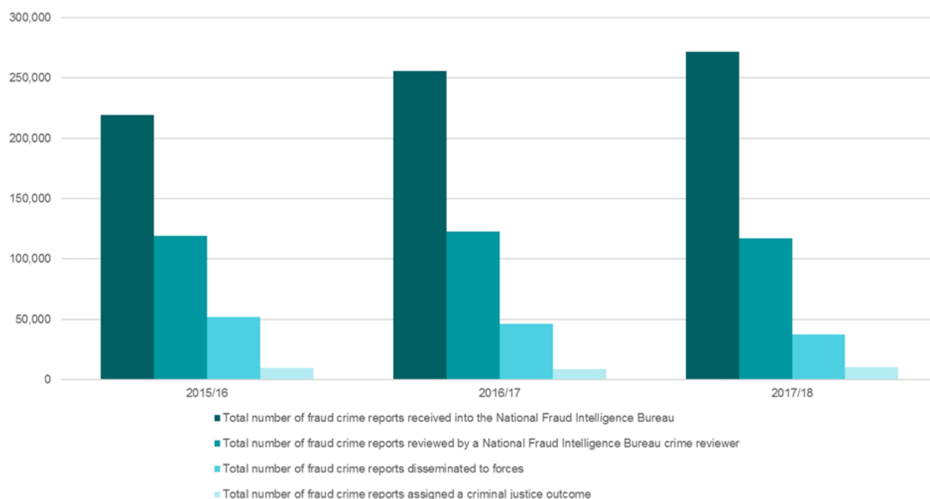
Figure 1: Number of crime reports received, reviewed by a National Fraud Intelligence Bureau reviewer, disseminated to forces and assigned a criminal justice outcome in England and Wales in 2017/18

1.37. Despite the number of reported frauds increasing over the last three years, the number of cases disseminated to forces for investigation has reduced while the number receiving a criminal justice outcome has remained relatively static. Figure 1 shows the number of frauds reported over recent years and those allocated a criminal justice outcome.