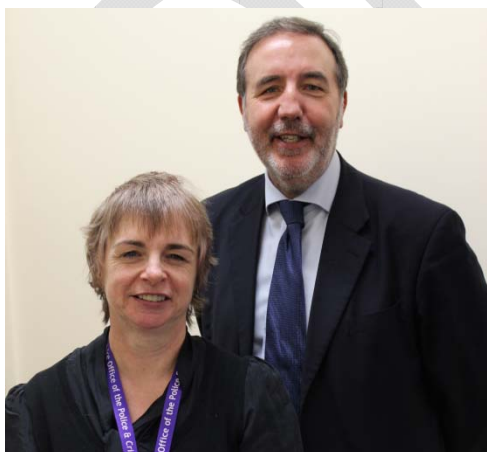
Nottinghamshire's Police and Crime Commissioner: Paddy Tipping

This Plan is pivotal to my overall ambition for a safer Nottinghamshire and I'm looking forward to building on this year's achievements in 2014. As always your thoughts and opinions will guide the direction we take in the future and I appeal to you to keep the communication flowing so I can continue to make your views count.